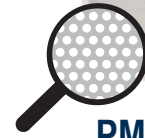
PMR, PMRA or PMRAA